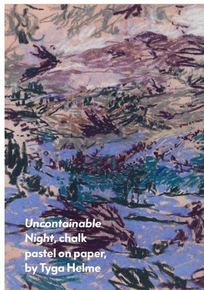
Uncontainable Night , chalk pastel on paper, by Tyga Helme