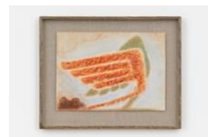
Audible Shapes, 2024 Oil pastel on paper 27.6 x 37.7 cm 10 7/8 x 14 7/8 in Framed: 39.2 x 48.7 x 3.6 cm 15 3/8 x 19 1/8 x 1 3/8 in