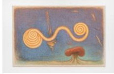
Christ Powder , 2024 Oil on canvas 112 x 168 cm 44 1/8 x 66 1/8 in