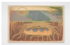
Of Oil and Earth , 2023 Oil on canvas 76.2 x 112 x 2.4 cm 30 x 44 1/8 x 1 in