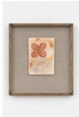
Solomon's Knot, 2024 Oil pastel on paper 14.7 x 10.5 cm 5 3/4 x 4 1/8 in Framed: 28.9 x 25.7 x 3.6 cm 11 3/8 x 10 1/8 x 1 3/8 in