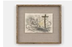
A Shining Emptiness, 2024 Watercolour and charcoal on paper 14 x 19.7 cm 5 1/2 x 7 3/4 in Framed: 27.7 x 31.9 x 3.6 cm 10 7/8 x 12 1/2 x 1 3/8 in