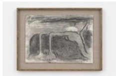
Backwards, Inwards and Downwards, 2024 Charcoal on paper 29.9 x 41.8 cm 11 3/4 x 16 1/2 in Framed: 38.8 x 58.6 x 3.6 cm 15 1/4 x 23 1/8 x 1 3/8 in