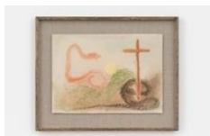
Conquer by this Sign, 2024 Oil pastel on paper 27.5 x 37.8 cm 10 7/8 x 14 7/8 in Framed: 39.2 x 48.7 x 3.6 cm 15 3/8 x 19 1/8 x 1 3/8 in