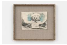
My Light Form, 2024 Watercolour and charcoal on paper 13.8 x 19.7 cm 5 3/8 x 7 3/4 in Framed: 27.7 x 31.9 x 3.6 cm 10 7/8 x 12 1/2 x 1 3/8 in