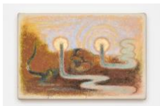
With the Echo, 2024 Oil on canvas 20 x 30 x 1.9 cm 7 7/8 x 11 3/4 x 3/4 in