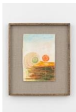
Inward Fruit , 2024 Oil pastel on paper 25.3 x 17.2 cm 10 x 6 3/4 in Framed: 38.6 x 33.1 x 3.6 cm 15 1/4 x 13 x 1 3/8 in