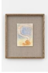
Liquid Knowledge, 2024 Oil pastel on paper 14.7 x 10.6 cm 5 3/4 x 4 1/8 in Framed: 28.5 x 25.8 x 3.6 cm 11 1/4 x 10 1/8 x 1 3/8 in