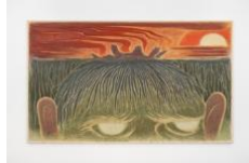
Cathedral, 2024 Oil and sand on canvas 180.2 x 300.5 x 4 cm 71 x 118 1/4 x 1 5/8 in