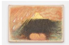
Brain Licker, 2024 Oil on canvas 20 x 30 cm 7 7/8 x 11 3/4 in