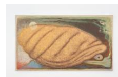
Silent Cipher, 2024 Oil on canvas 96.8 x 167.9 x 2.4 cm 38 1/8 x 66 1/8 x 1 in