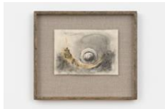
Everything that was Ever Created, 2024 Watercolour and charcoal on paper 14.2 x 19.9 cm 5 5/8 x 7 7/8 in Framed: 27.7 x 31.9 x 3.6 cm 10 7/8 x 12 1/2 x 1 3/8 in