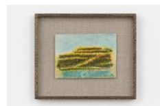
The True Cross, 2024 Oil pastel on paper 13.8 x 19 cm 5 3/8 x 7 1/2 in Framed: 26.5 x 31.2 x 3.6 cm 10 3/8 x 12 1/4 x 1 3/8 in