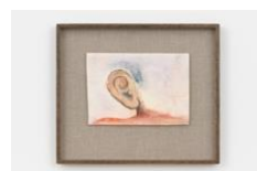
What the Thunder Said, 2024 Oil pastel on paper 17.7 x 25 cm 7 x 9 7/8 in Framed: 34.4 x 39.8 x 3.6 cm 13 1/2 x 15 5/8 x 1 3/8 in