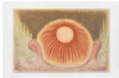
Humming from all Quarters , 2024 Oil on canvas 112.4 x 167.7 x 2.5 cm 44 1/4 x 66 x 1 in