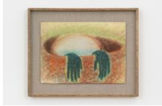
Hunters Lodge, 2024 Oil pastel on paper 27.5 x 37.8 cm 10 7/8 x 14 7/8 in Framed: 39.2 x 48.7 x 3.6 cm 15 3/8 x 19 1/8 x 1 3/8 in