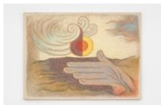
Retreat Inside , 2024 Oil and sand on canvas 76.5 x 101.6 x 2.4 cm 30 1/8 x 40 x 1 in