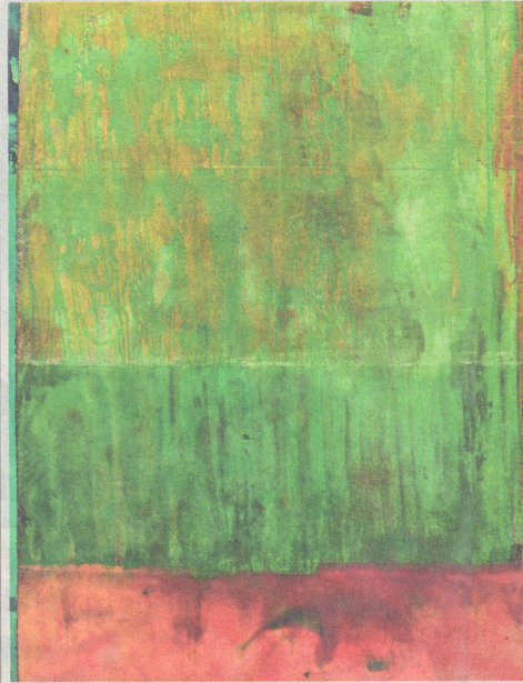
Frankenthaler and Morris Louis. This "colour-field" painting was promoted by Clement Greenberg, the leading critic, who homed in on Bowling as the only non-American worthy of

inclusion in his pantheon. Indeed, Bowling, who was given a show at the Whitney Museum of American Art in 1971, is still considered American by Americans, and when the