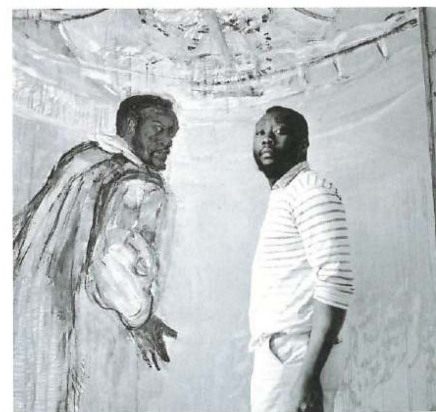
Bowling along: clockwise, Dog Daze ; Great Thames IV ; the artist with his 1962 Self-portrait as Othello ; and Mirror